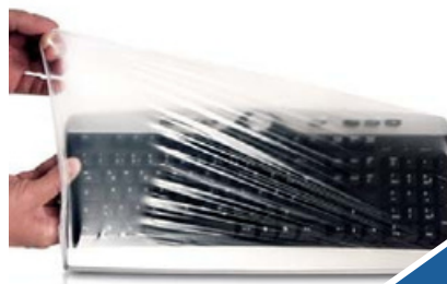
2. Pull the foil over the keyboard