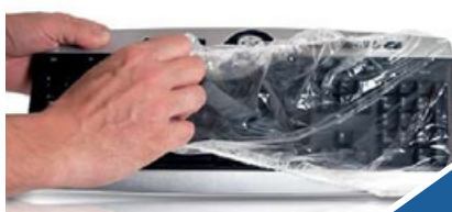
1. Apply Keyboard Cover