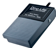
SW-F1 footpedal - capture handsfree