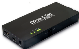
WF-10 work wirelessly