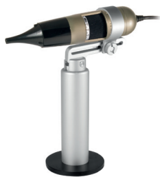
HDE-01 EarScope holder

Pictures made with Dino-Lite can be stored in the Electronic Patient File simply by means of 3 mouse clicks. I can easily add pictures to my 'library' of ear affections. A picture says more than many words; the emergency of a patient's case can be judged very quickly. I am very fond of visualization."